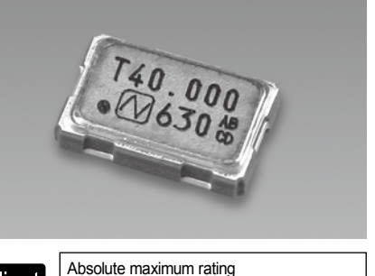
RoHS Compliant Directive 2011/65/EU